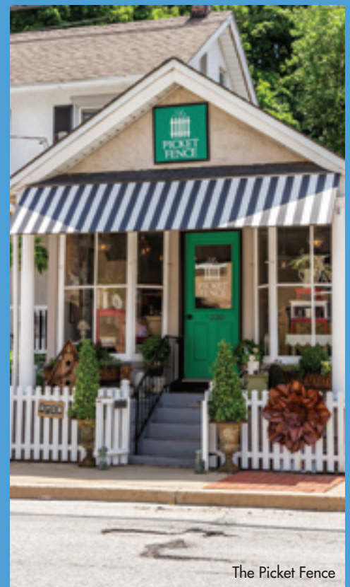
The Picket Fence