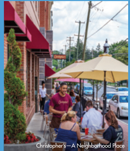
Christopher's—A Neighborhood Place

Ready for a regal repast after your stroll? In addition to comfort foods at Julie Anne's Place, pub grub and beer at the Flying Pig Saloon, delectables at the Malvern Buttery and pizza at Malvern Pizza and Beer—found easily by the giant mural on the side of the