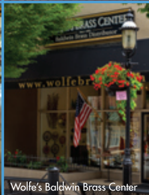
Wolfe's Baldwin Brass Center