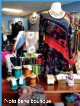
Nota Bene Boutique