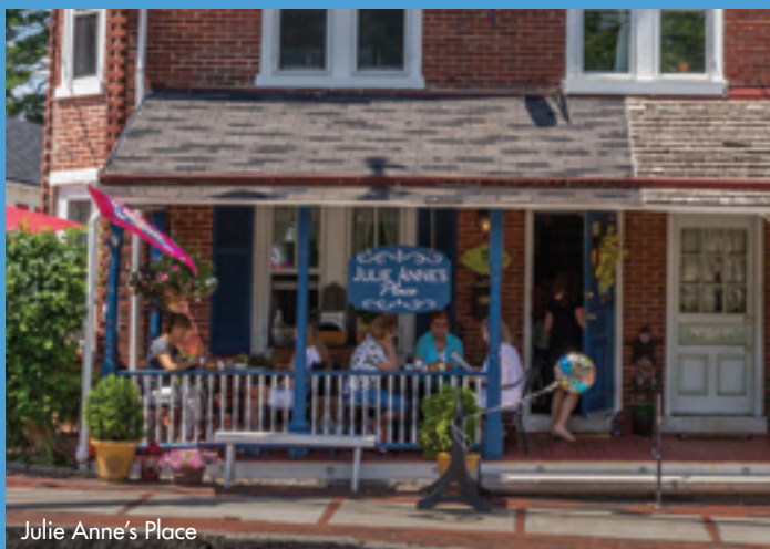
Julie Anne's Place