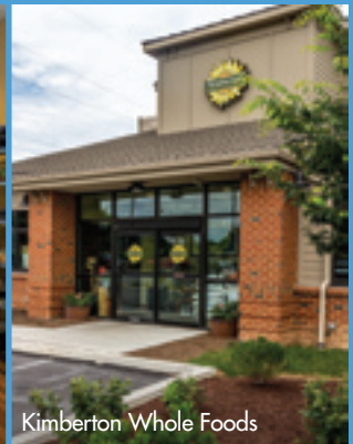
Kimberton Whole Foods